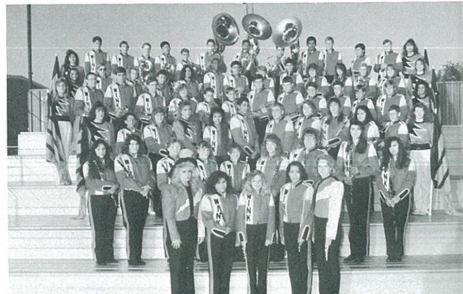
The 1992-93 Baad Cat Band.